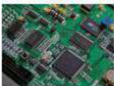
High speed CPU control circuit