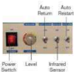
Power Switch Level Infrared Sensor